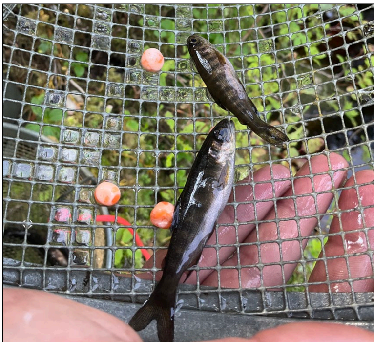
Figure 1.—Juvenile coho salmon captured at waypoint 694.