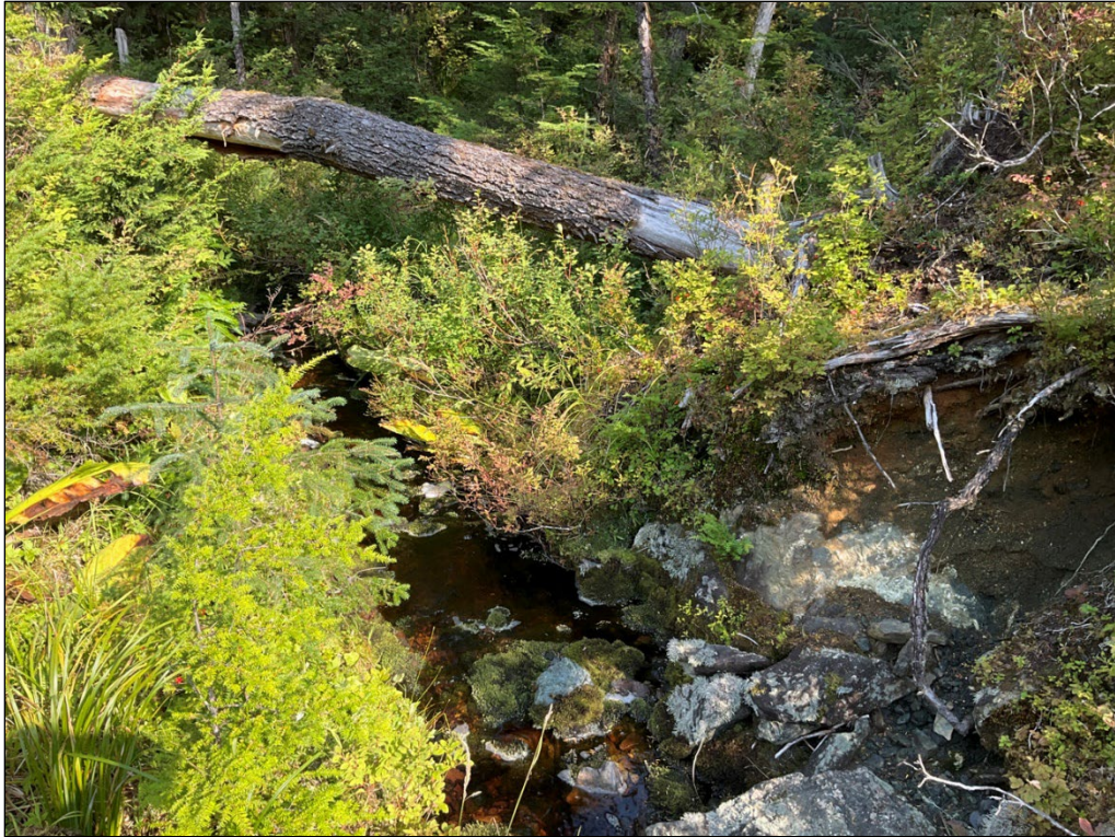
Figure 2.—Stream No. 110-16-10040-2004 at waypoint 694.