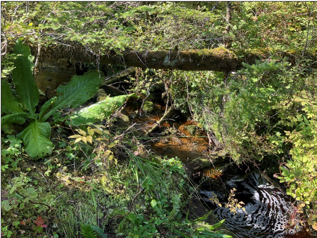
Figure 3.— Stream No. 110-16-10040-2004 at waypoint 687.